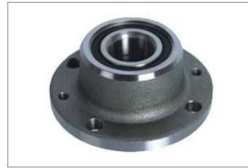
Generic rendering of approximately 1-inch diameter part