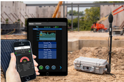
LD Atlas™ Mobile App