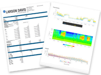
G4 LD Utility Measurement Report