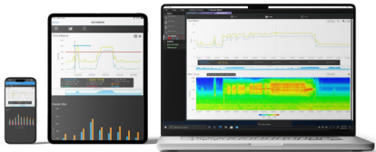
Apps for Phone, Tablet, and Windows®