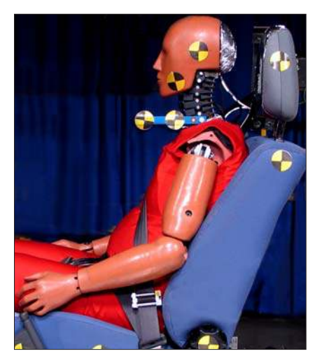
Figure 2. Crash-test dummy.