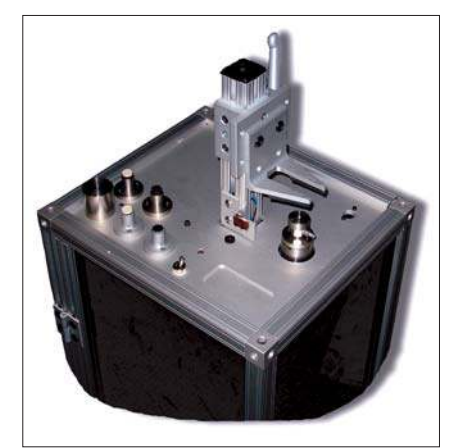
Figure 3. 9155C-525 pneumatic shock exciter.