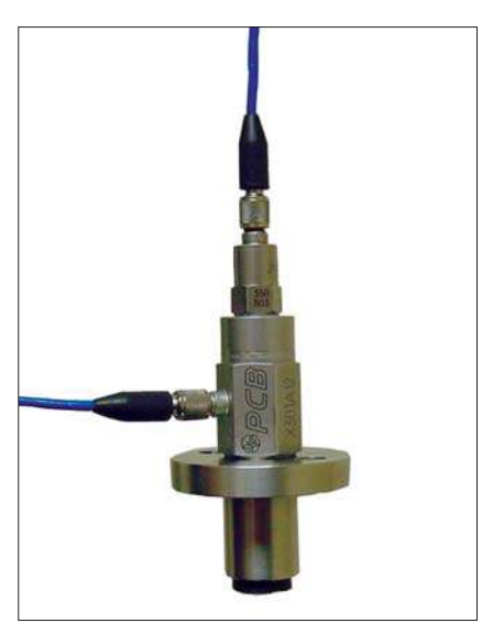
Figure 4. test transducer, reference transducer, and anvil mounting arrangement.