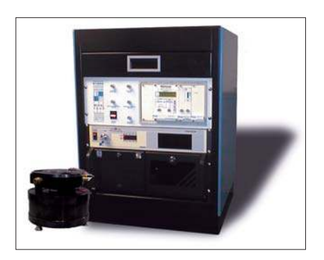
Figure 1. Accelerometer calibration workstation next to an electrodynamic air bearing calibration shaker.<sup>1</sup>

The authors can be contacted at: calibration@ modalshop.com. Please visit: <u>www.pcb.com</u> for more information on this and other PCB products.